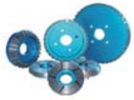
Metallic diamond wheels